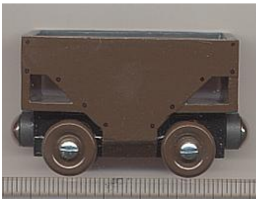
'99 Brown Hopper car

In 1999, I pretty much kept the hopper car design the same. I switched to maple and left out the nails (the paint rubs off anyhow), but I drew rivets on in their place. I tried a new gray color scheme (the wheels match the interior), but it's a little bland. Lettering the sides would help.