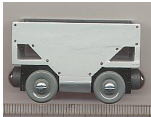
'99 Gray Hopper car