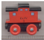
Freight train sets

I've split the gallery into sections, but there are still a lot of images on each page. They may take a little while to load everything.